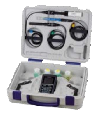
Useful accessories support versatile applications in the field.

Case sets including sensors allow immediate use